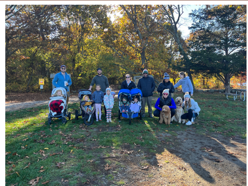
It was a brisk, fall morning for a family fun run/walk at Bluff Point State Park!